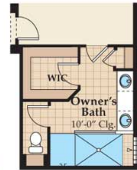
Owner's Bath with Optional Walk-in Shower