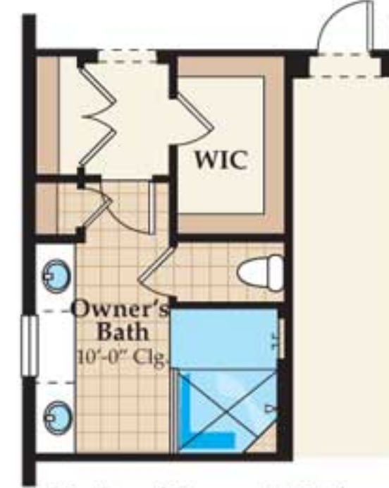
Optional Owner's Bath w/Walk-in Shower